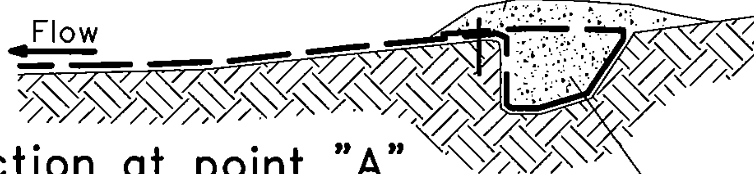
Centreline section at point "A".

Overlap - bury upper end of lower blanket as in 'A'. Overlap end of top blanket 300 mm and staple at 150 mm centres